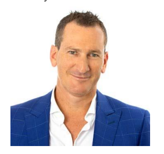
Law) – Qld; Queensland Law Society Senior Counsellor

in 2014. His current firm has grown from himself and three part-timers to a team of almost 60 in less than five years.